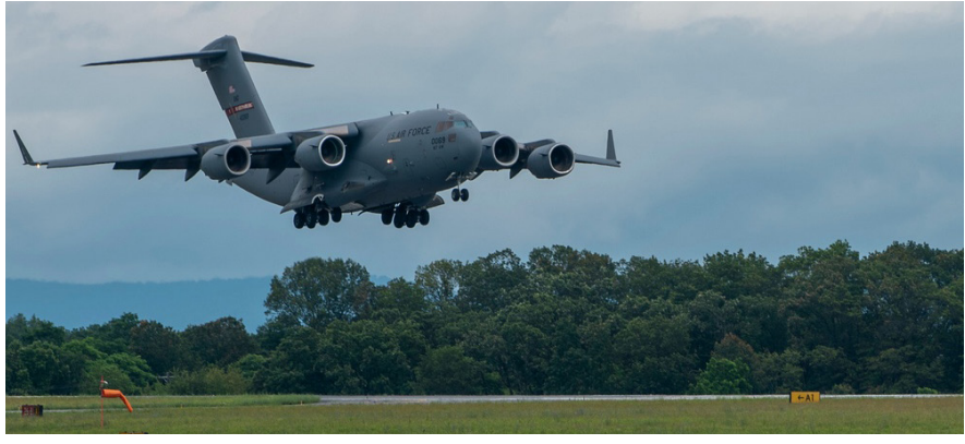
All photographs included in this brochure are from U.S. Government sources.