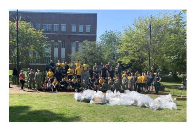
Approximately 75 personnel spent the morning picking up trash during Clean the Base Day at Naval Support Activity Hampton Roads-Headquarters Annex on April 22. https://www.dvidshub.net/image/7159555/naval-supportactivity-hampton-roads-personnel-participate-clean-base-day

Clean the Bay Day 2022 has been a positive display of DoD teamwork and demonstrated strong leadership and commitment to the protection and restoration of the Chesapeake Bay. With volunteers ranging from DoD employees, civilians, military personnel, and their families, Clean the Bay Day serves as a way for DoD installations to play a vital role in making the Chesapeake Bay more beautiful by preventing and picking up litter.