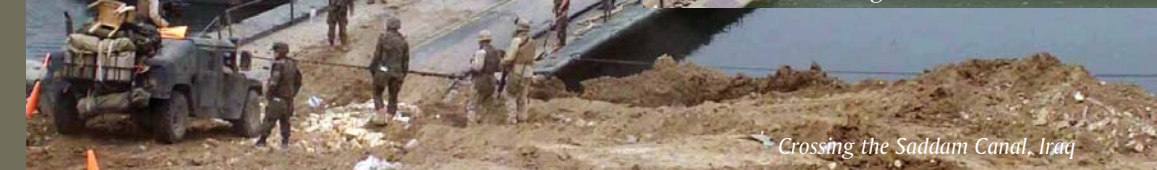
Crossing the Saddam Canal, Iraq