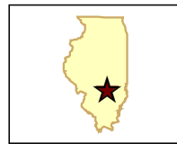
Figure 2-1 Effingham TA Location and Operational Range Area