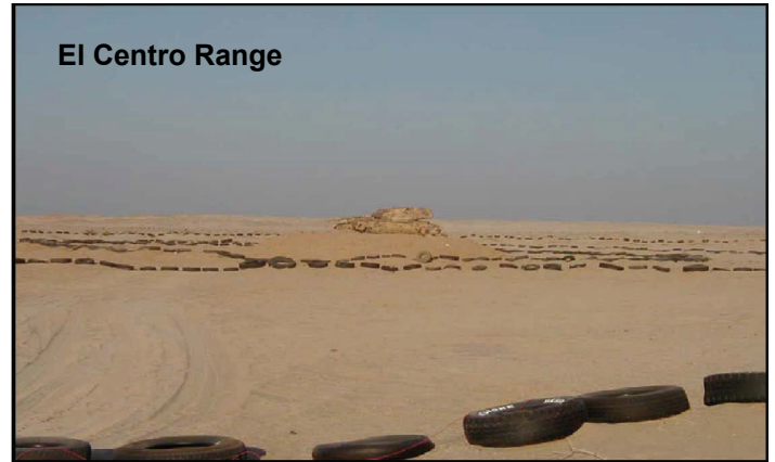
El Centro Range

The Navy's Range Sustainment Program is designed to ensure our ranges remain operational and that we are protecting human health and the environment for nearby communities while we train. The Range Sustainment Environmental Program Assessment (RSEPA) Process is designed to assess environmental impacts of testing and training operations and to implement measures to protect the environment when needed. RSEPA was developed in response to a proactive Navy initiative, and is not driven by any federal or state regulatory requirements.