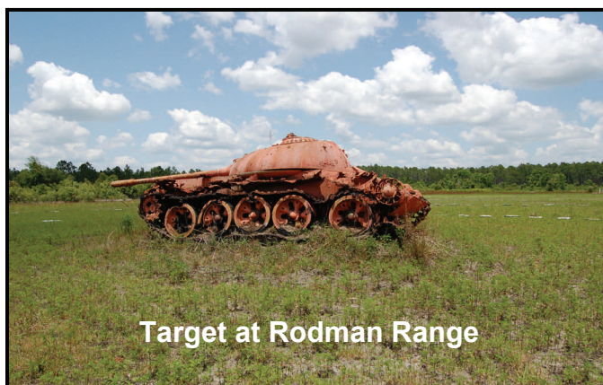
Target at Rodman Range

A conceptual site model of the range is created during the RCA to assist in the analysis of potential off-range migration of munitions constituents. Munitions constituents are defined as; “...materials originating from munitions, including explosive, non-explosive, emissions, degradation or breakdown elements...”