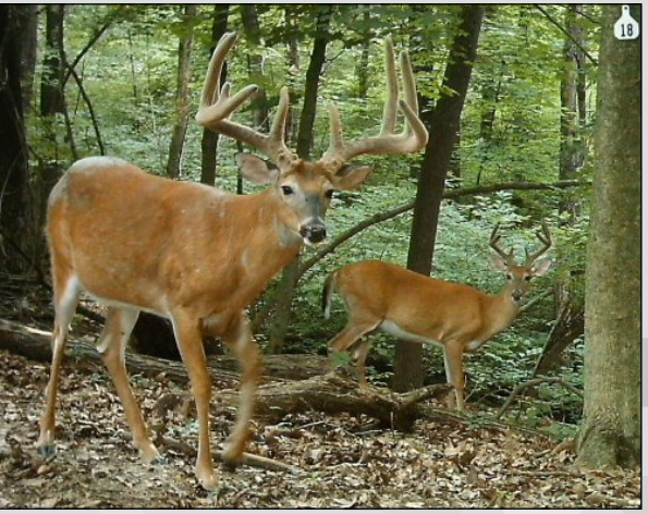
Deer at Fort Knox, Kentucky

Avoid death or injury by recognizing that you may have encountered a munition and promptly retreating from the area. If you encounter what you believe is a munition, do not approach, touch, or disturb it. Instead, immediately and carefully leave the area by retracing your steps—going out the way you entered. Once safely away from the munition, mark the path (e.g., with a piece of clothing) so response personnel can find the munition.